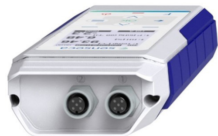
PRO D05.2 - 2 inputs, M12 sensor connectors