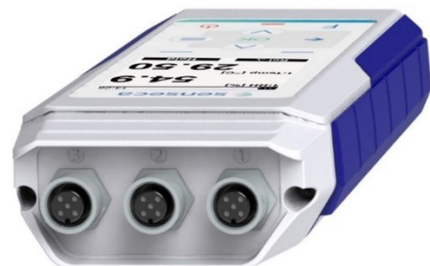
PRO D05.3 - 3 inputs, M12 sensor connectors