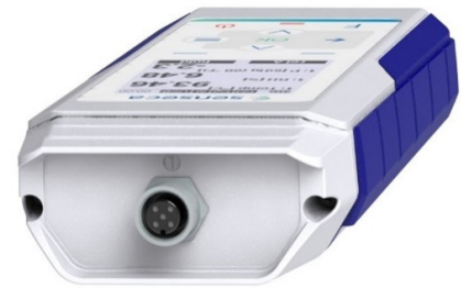
PRO D01 - 1 input, M12 sensor connectors